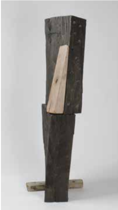
11 & 12