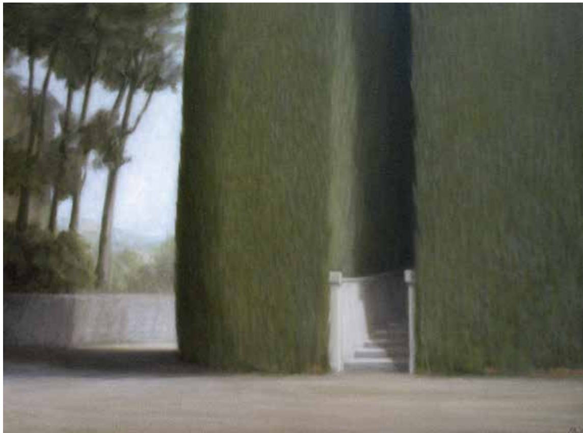
Which way now? (Boboli Gardens) 2013 oil on canvas 60.0 x 81.0cm Private collection