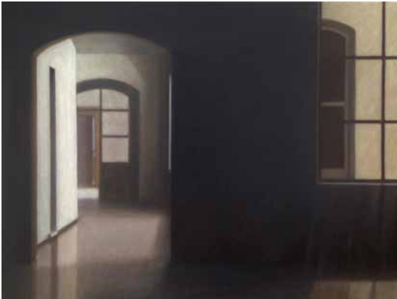
The way beyond 2014 oil on canvas 76.0 x 102.0cm Artist collection