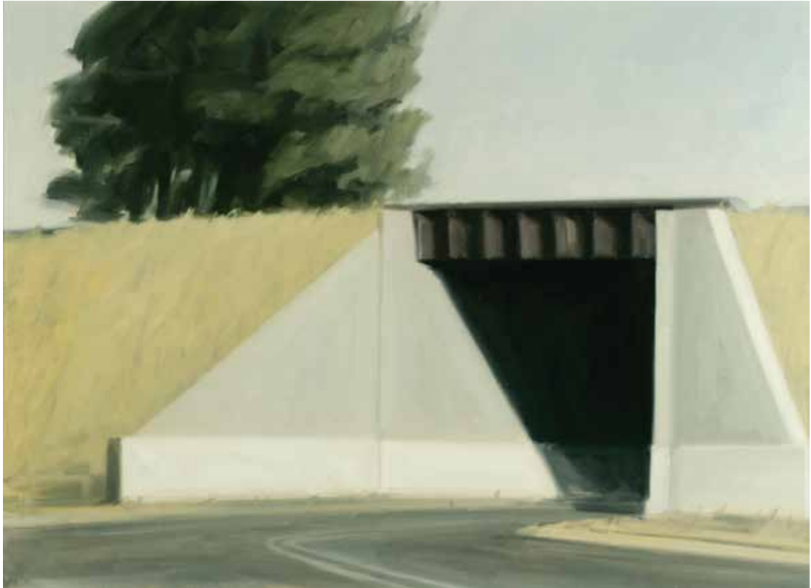
The road leads from here to where? 2014 oil on board 51.0 x 71.0cm Artist collection