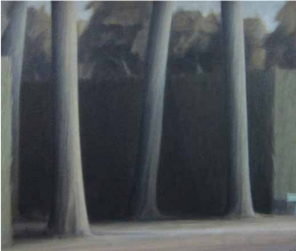
In the garden of dreams iii 2009 oil on canvas 50.0 x 56.0 cm Artist collection