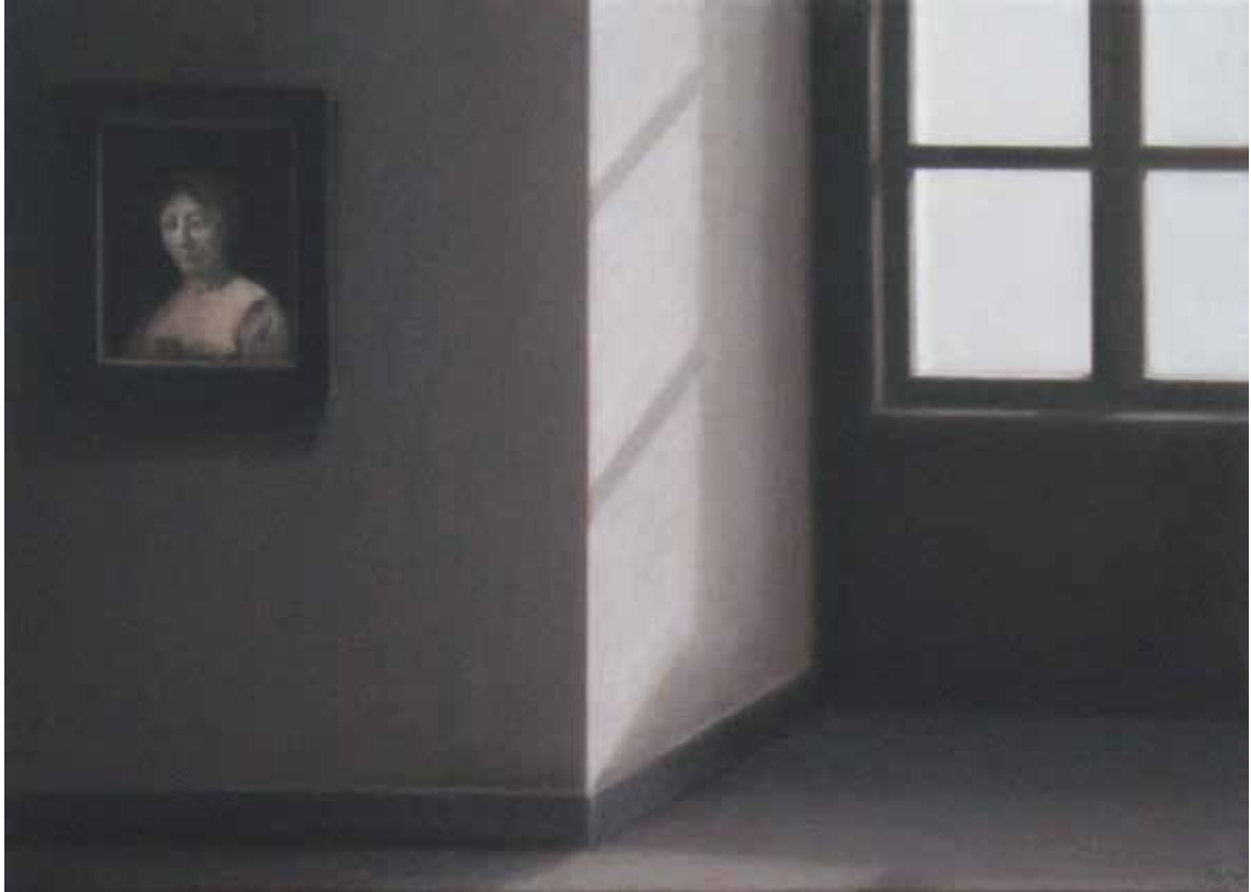
Silent witness 2014 oil on canvas 34.7 x 48.8cm Artist collection