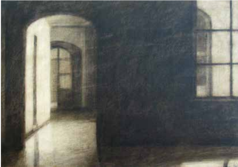
Cloister 2014 oil and graphite on board 43.0 x 62.0cm Stephen Spinak collection