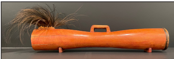
Wilfred ANIBA Drum ( Buru buru ) 1989 wood, cassowary feathers 91.4 x 17.0cm Queensland Museum Collection

Traditional drums are made out of wood, which has been hollowed out by burning and chipping from each end until the holes met at the waist