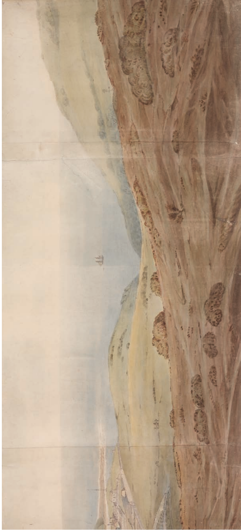
Edward Close Part 2. Panorama of Newcastle (detail) 1821 watercolour, seven sheets laid onto cloth backing Purchased 1926 State Library of NSW collection