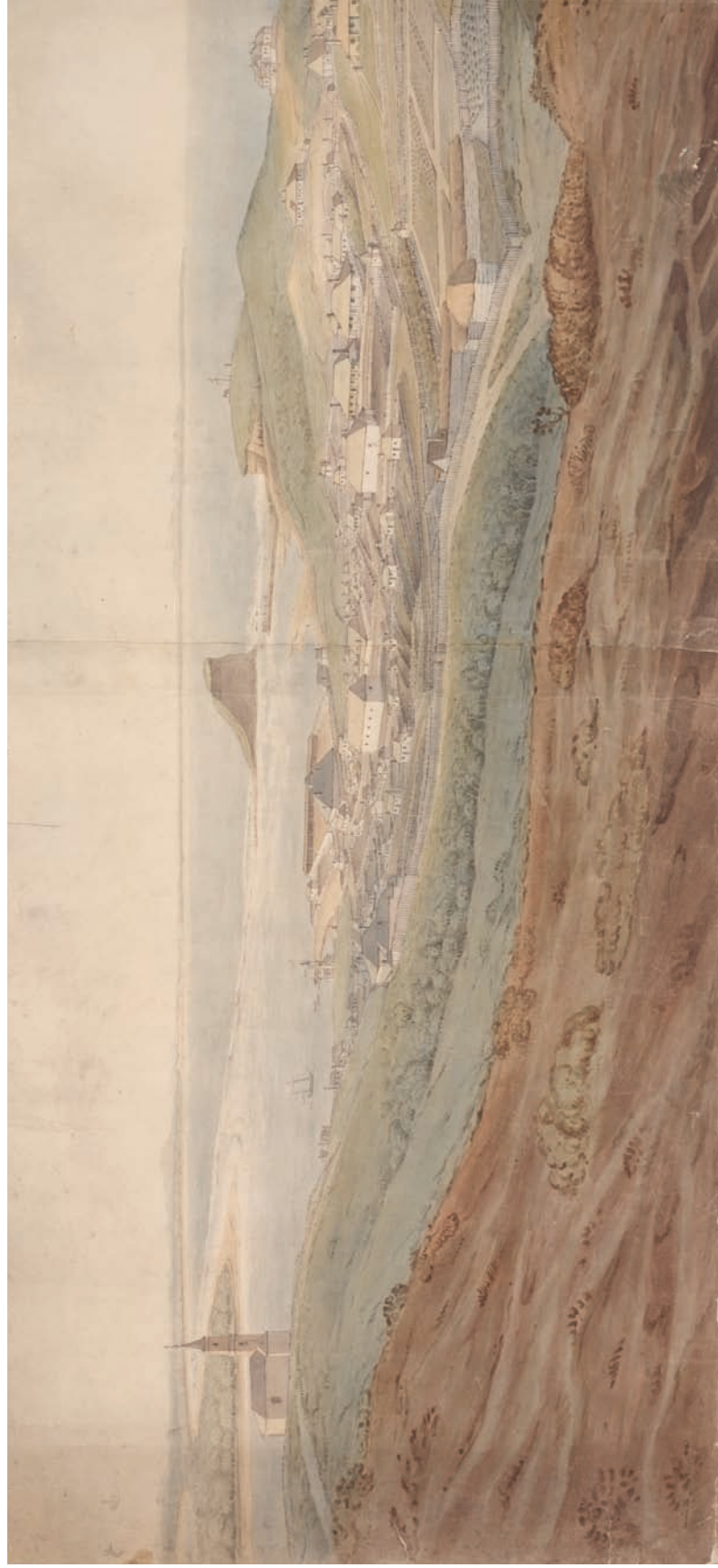
Edward Close Part 1 Panorama of Newcastle (detail) 1821 watercolour, seven sheets laid onto cloth backing Purchased 1926 State Library of NSW collection