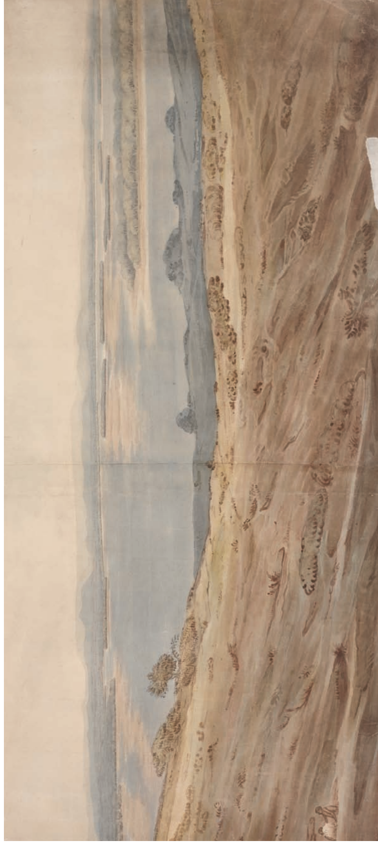
Edward Close Part 4. Panorama of Newcastle (detail) 1821 watercolour, seven sheets laid onto cloth backing Purchased 1926 State Library of NSW collection