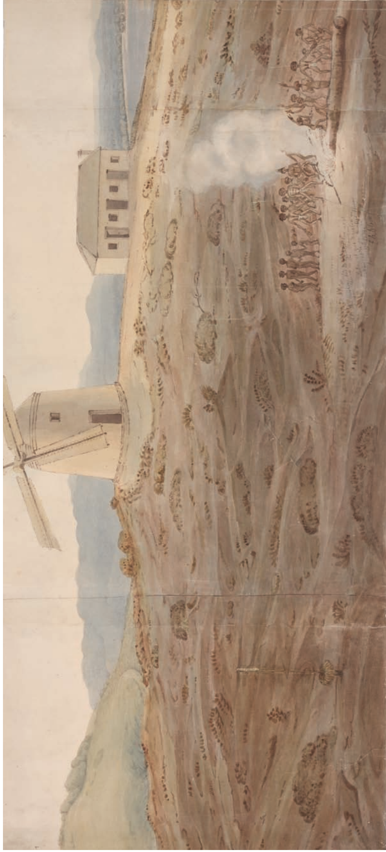
Edward Close Part 3 Panorama of Newcastle (detail) 1821 watercolour, seven sheets laid onto cloth backing Purchased 1926 State Library of NSW collection