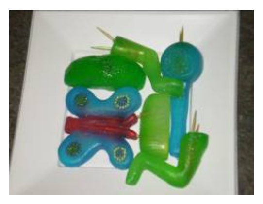
Sections ready to join by toothpick.