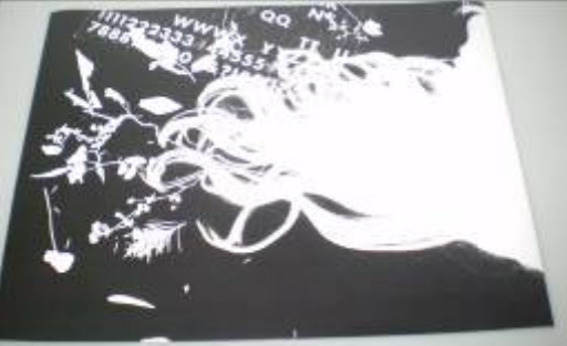
Student examples of photograms, MCA Bella Workshop April 2008.