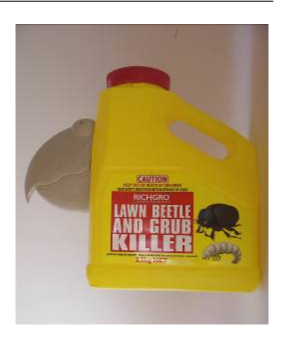
Fiona Hall Mourning Chorus (2007 – 08) (detail) resin, plastic, vitrine dimensions variable Courtesy of the artist and Roslyn Oxley9 Gallery, Sydney, Australia O the artist

http://collections.tepapa.govt.nz/Search.aspx ?imagesonly=on&advanced=colCollectionTy pe%3ABirds