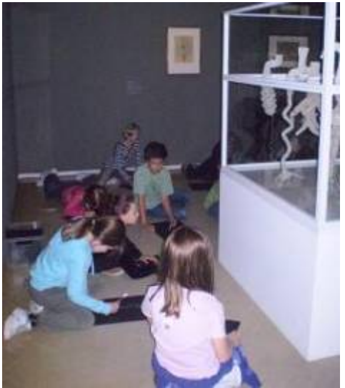
Drawing Dead in the Water (1999). MCA School Holiday Programs, April 2008

Select one item in Dead in the water (1999). Use white pencil to draw the "above" and "below the water" views on two sheets of black paper. Use the pencil to try to capture the surface detail of the objects, and leave areas of black paper to show the negative spaces.