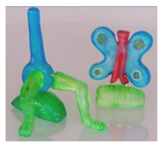
Soap carving examples.