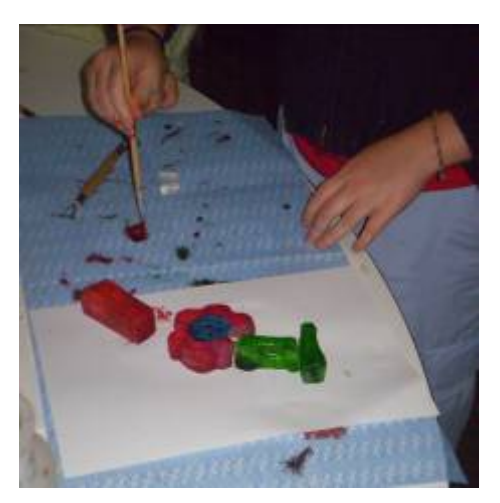
Painting the carving with food colouring. Photograph: Justine McLisky, 2008