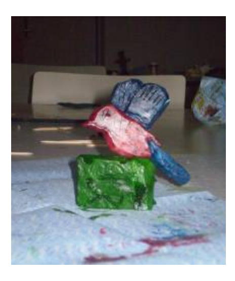
Bird/camera hybrid soap carving. Photograph: Justine McLisky, 2008