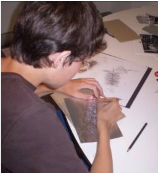
Embossing the drawing design into the metal surface.