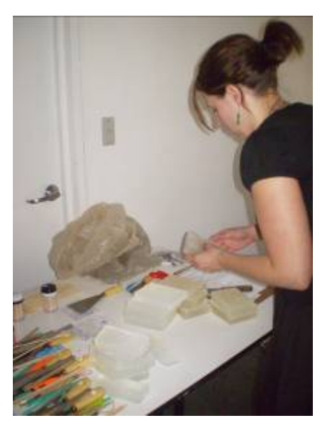
Sectioning the soap.

Sculptures can be installed onto upturned . plastic plates or squares of cardboard as a 'plinth'.