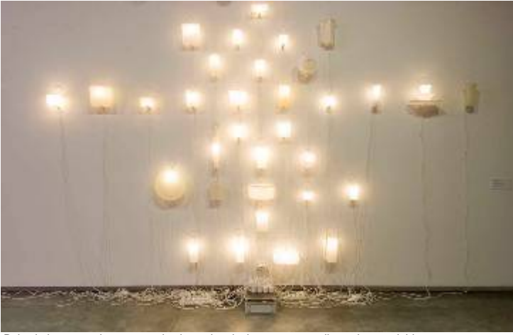
Polyethylene containers, ceramic plate, electrical components, dimensions variable Museum of Contemporary Art, purchased 1995 © the artist

The Price is Right is a major installation constructed from unassuming polyethylene 'Tupperware' containers. Sensor-activated lights flash Morse code from inside the opaque containers when viewers approach, cumulatively spelling out the sentence "I have the misfortune of not being a fool". The work's obscure Morse code message is a line appropriated from Charles Dickens' 1857 rags-to-riches tale Little Dorrit , a book which cautions against precisely the kind of "get rich quick" aspirations now promoted by television game shows, such as the one which gives the work its title.