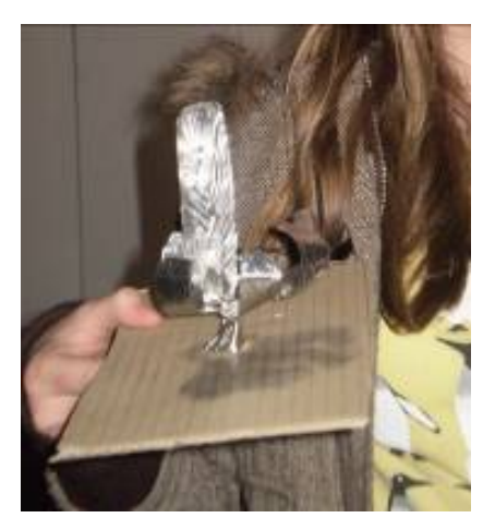
Student example of metal embossing and filigree sculpture, MCA 2008

Teachers can adapt the Metal Embossing activity in this kit to suit Secondary students, and extend it to relate to Fiona Hall's Paradisus Terrestris series. Students can use scissors to extend the flat relief works into filigreed works which stand on a plinth by cutting, folding and arranging the edges of the piece to make this a three-dimensional sculptural object. Students can extend the repoussé technique by working through the back of the metal to make works which are highly modelled.