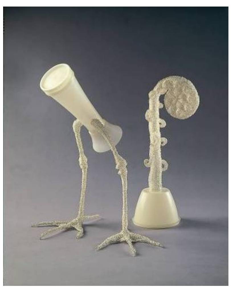
Fiona Hall Cell Culture 2001-02 (detail) glass beads, silver wire, Tupperware, vitrine vitrine: 157 x 247 x 90 cm South Australian Government Grant 2002, Art Gallery of South Australia Courtesy of the artist and Roslyn Oxley9 Gallery, Sydney, Australia © the artist

Museum of Contemporary Art, Sydney 6 March – 1 June 2008